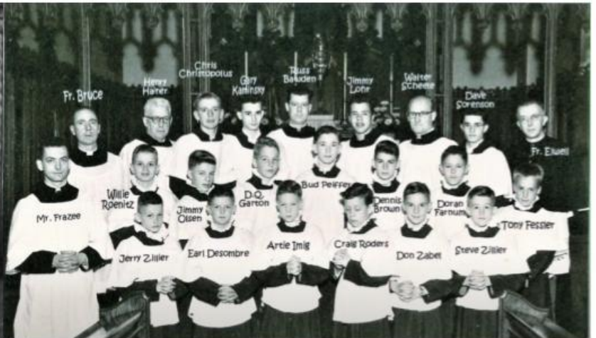
The choir in 1954