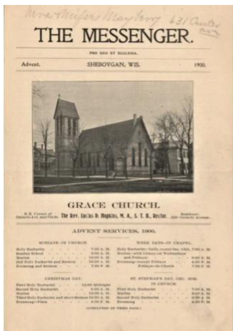
The Angelus' predecessor, The Messenger, in 1900

"For the Christian, therefore, holiness is the fruit of our association with Jesus. It seems to set us apart, not in the sense of being other-worldly, but rather in the sense of being grasped by the Kingdom vision that formed the center of Jesus's life and message. The call to holiness is a call to live in the world, but not of it—meaning that as we open ourselves to the relationship Jesus offers, we are more and more able to live from a perspective and vision that transcends what we normally experience."