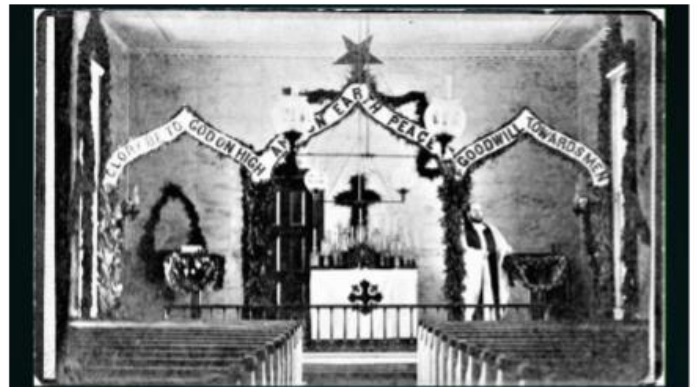
Grace's first building in 1860