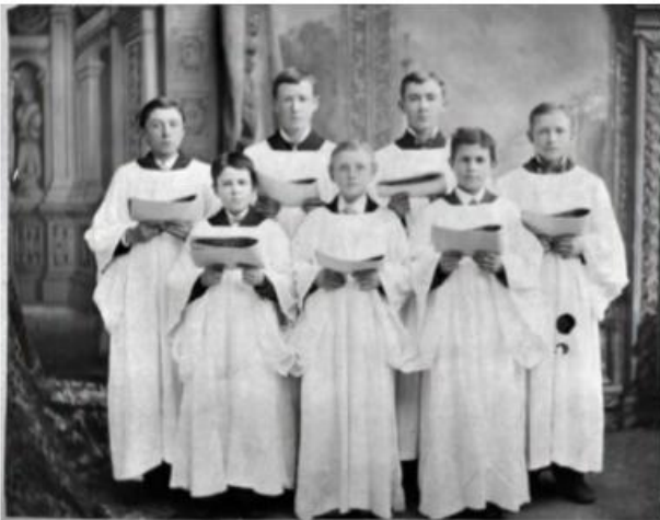
The first choir in 1879