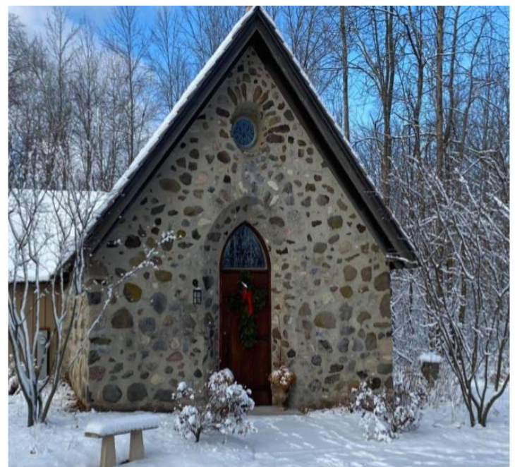
All Saints Chapel, Elkhart Lake