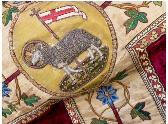
Absolutely stunning 19 th century Velvet and Silk Embroidery Ecclesiastic Vestment. A Sumptuous and symbolic work, the Agnus Dei (Risen Lamb) on the back panel is expertly worked in silver metallic coils.